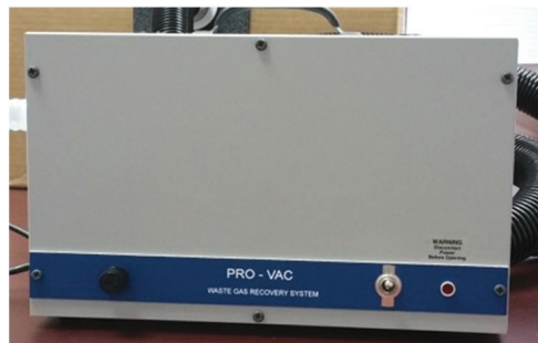
Pro-Vac Portable Scavenging System