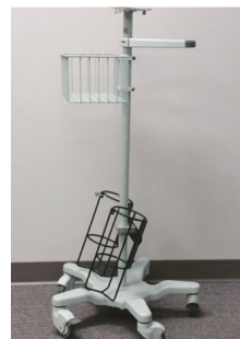
Pro-Nox E-Cylinder Mobile Cart