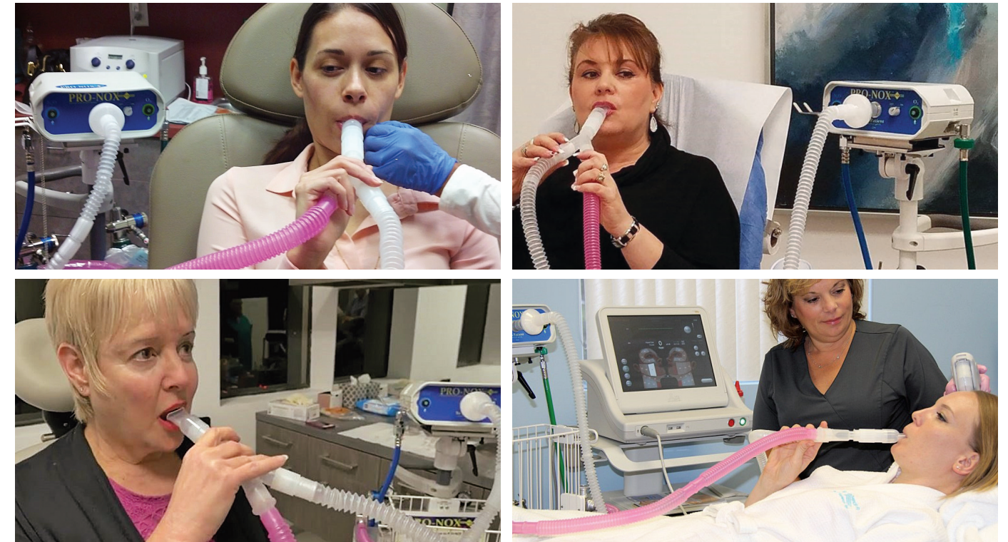
Patients using Pro-Nox in procedure rooms

The Premier Name in Nitrous Oxide Systems