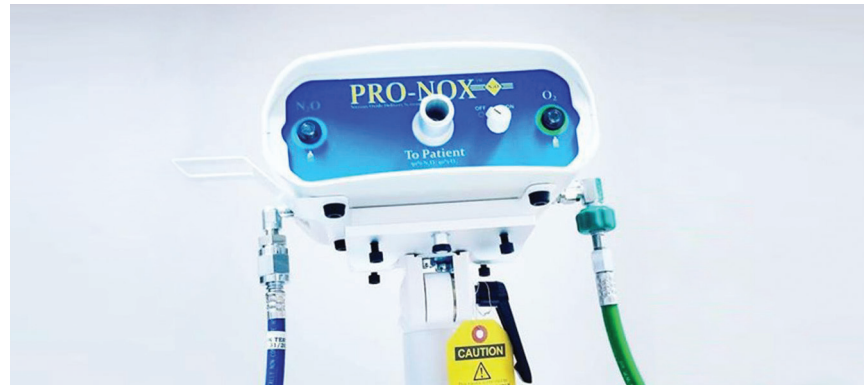
Pro-Nox Nitrous Oxide System

The CAREstream team is here to support you through continuous learning on our many webinars, training sessions and more! In addition to the outstanding support personnel, we can provide you with Articles, Studies, References and so much more. We are here to help you through the process of adding Nitrous to your pain management toolbox.