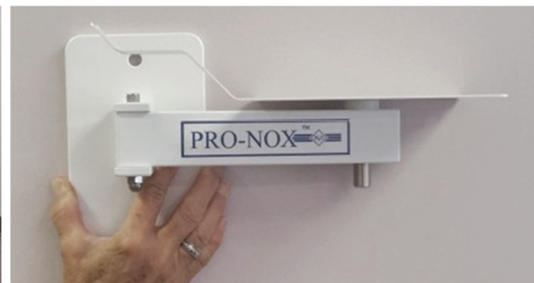
Pro-Nox Wall Mount